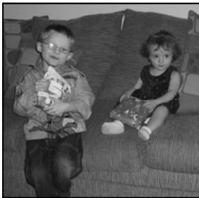
A brother & sister enjoy opening gifts received from generous donors.

Our community also demonstrated its' volunteer spirit in the 2007 Everyone Counts Project, held on the night of January 24th. Approximately 200 volunteers worked to secure an actual count of homeless persons living on the streets in Oakland County. Many of these volunteers reported stirring, and in some cases, life changing experiences.