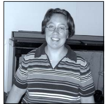
Relaxing in her family room.