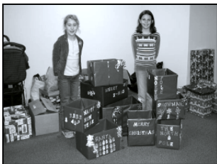
CHN volunteers give their time to help homeless families.