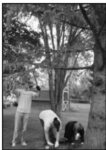
Employees from National City Bank worked hard to improve CHN homes.

On Wednesday, June 18 th thirty-four employees from National City Bank and several staff members from Community Housing Network participated in a Community Appreciation Day. They volunteered to “spruce up” four Community Housing Network homes for persons with disabilities. Four hardworking teams cleaned up yards, planted flowers, painted, and otherwise beautified the homes located in Rochester Hills,